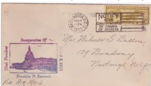
Figure 3 Franklin Roosevelt's first inaugural cover was among the first to be mass produced.

Inauguration in 1933. Commercial cachet makers began designing covers around the time of Dwight D. Eisenhower's second Inauguration in 1957, and by Ronald Reagan's second Inauguration, at least 228 different cachets were printed. For more information you may consult "Noble's Catalog of Cacheted Presidential Inaugural Covers – 1986" edited by Edward Krohn. Just as with First Day Covers, you can make your own Inauguration Day Cover and send it off to Washington, DC for the official cancel. Covers must be franked with the appropriate postage. Send your covers to Inaugural January 20 Cancellation, PO Box 92282, Washington, DC 20090-2282.