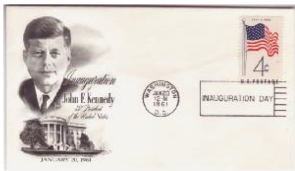
Figure 4 J. F. Kennedy's 1961 Inaugural cancel is located in a rectangular box.

Inauguration in 1933. Commercial cachet makers began designing covers around the time of Dwight D. Eisenhower's second Inauguration in 1957, and by Ronald Reagan's second Inauguration, at least 228 different cachets were printed. For more information you may consult "Noble's Catalog of Cacheted Presidential Inaugural Covers – 1986" edited by Edward Krohn. Just as with First Day Covers, you can make your own Inauguration Day Cover and send it off to Washington, DC for the official cancel. Covers must be franked with the appropriate postage. Send your covers to Inaugural January 20 Cancellation, PO Box 92282, Washington, DC 20090-2282.