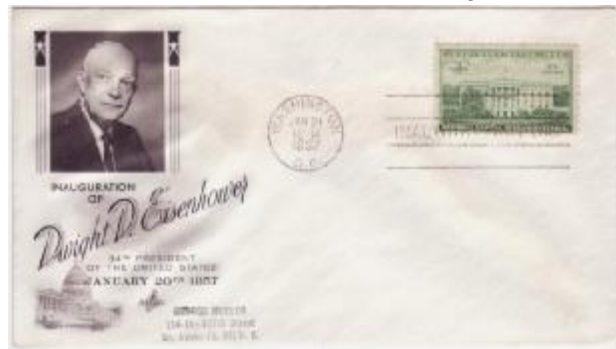
Figure 2 Eisenhower's 1957 Inaugural cover was the first to include the phrase "Inauguration Day."

DC became the site of the presidential inauguration was Thomas Jefferson's March 4, 1801 ceremony. After this date, only four presidents have been sworn-in in other cities, usually due to the untimely death of the President and the ascending to office of the Vice President. These include: Chester A. Arthur, September 20, 1881 in New York City; Theodore Roosevelt, September 14, 1901 in Buffalo, New York; Calvin Coolidge, August 3, 1923 in Plymouth, Vermont; and Lyndon B. Johnson, November 22, 1963 aboard Air Force One, at Love Field, Dallas, Texas. There are 41 known cachets for Franklin D. Roosevelt's first